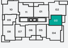
FLOORS 3, 5, 7, 9, 11, 13, 15